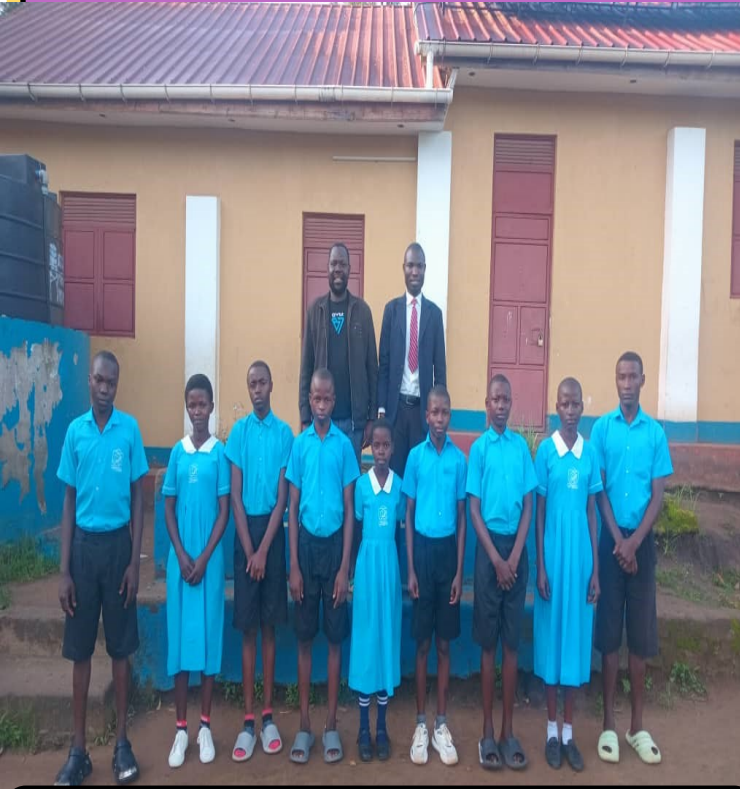
Secondary Education Financing