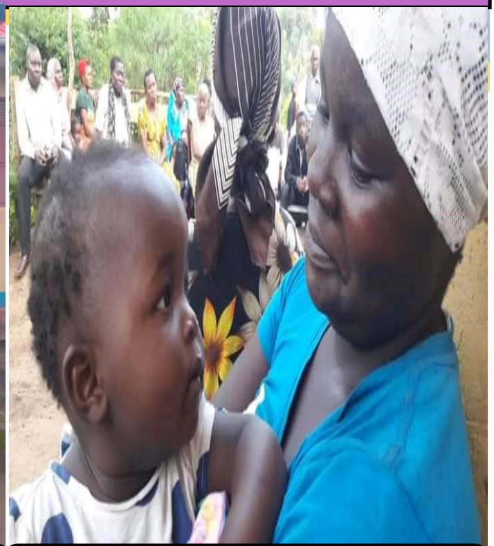
Breastfeeding for teenage Mothers