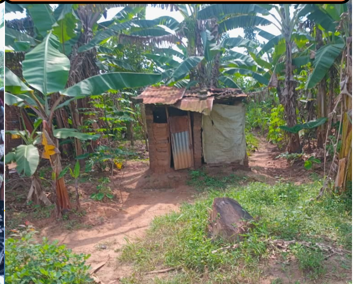
Pit Latrine Financing in Communities