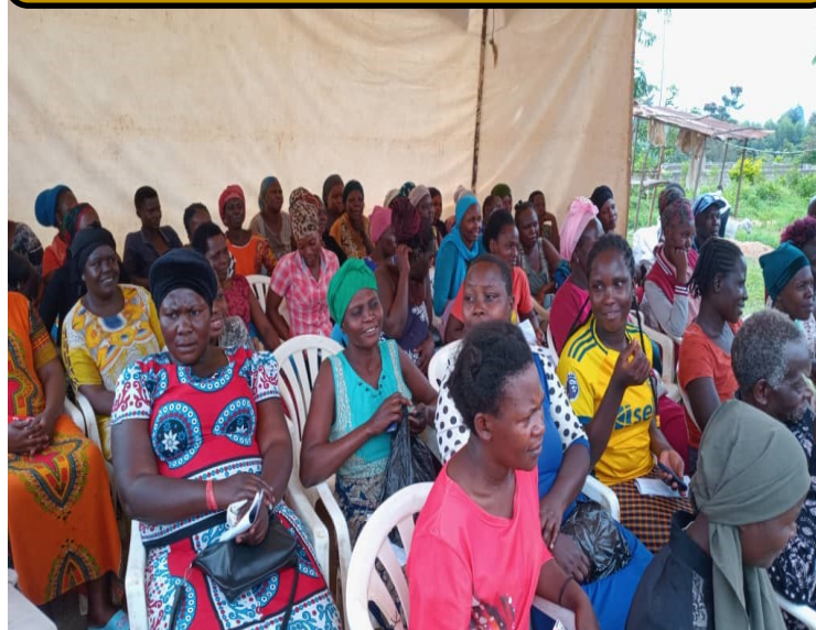
Women empowerment financing