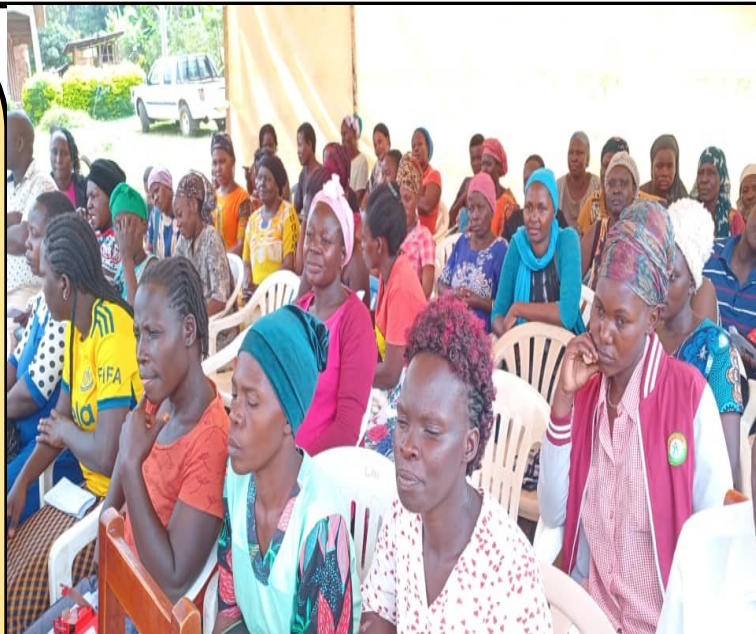
Women attending the 100Weeks launch