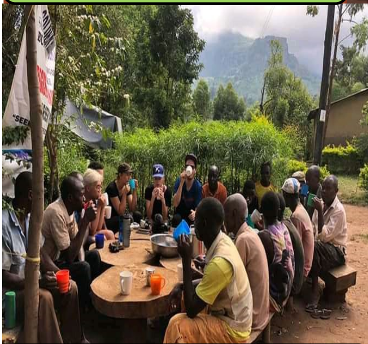
Breakfast moment with Volunteers