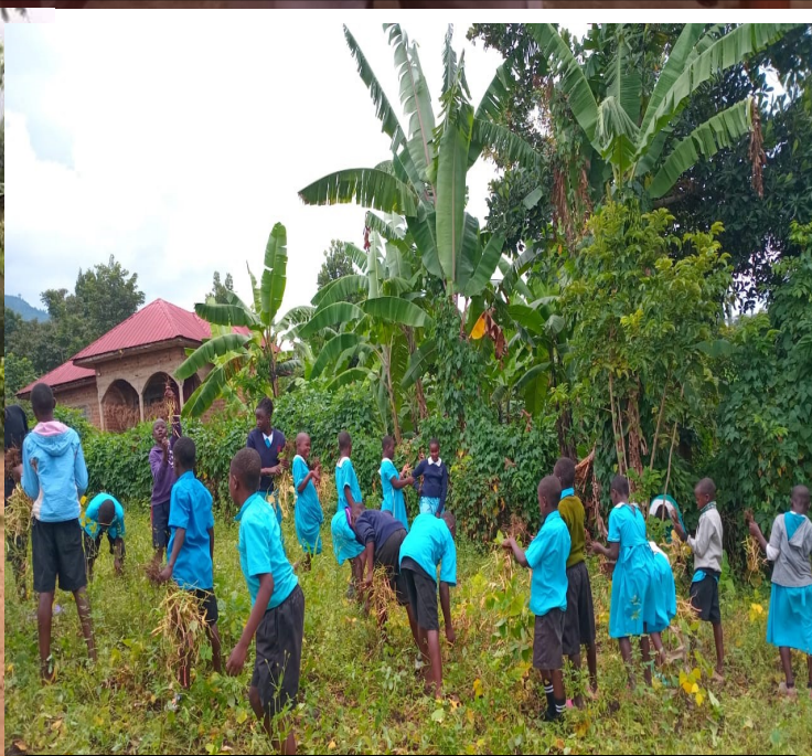
Pupils Harvesting Beans