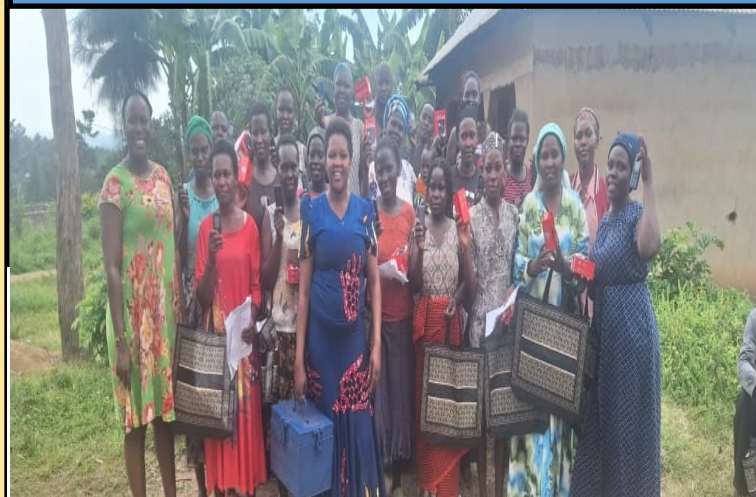
Group photo during 100Weeks launch at Mothers Heart Uganda Mutoto.

At Mothers Heart Uganda we are committed to transforming lives.