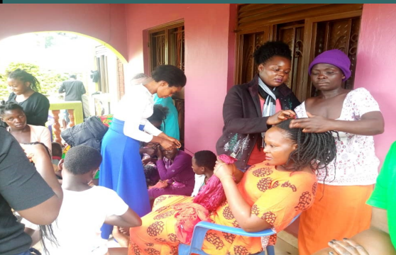
Community Dressing Class 2020