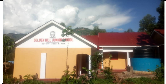
Newly constructed block

in Uganda due to Covid-19. the success is attributed to the team from 264, Mutoto community and above all God was on our side. Almighty God we are thankful