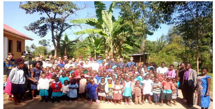
Golden hill Junior Staff, Pupils and 264 Volunteer