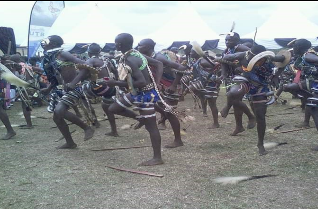
Cultural dance at Mutoto ground

THANK YOU FOR YOUR KIND DONATIONS IN 2020