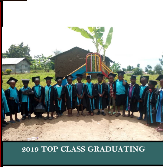
2019 TOP CLASS GRADUATING