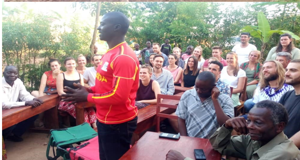
264 Volunteers meeting community leaders in Mutoto Village