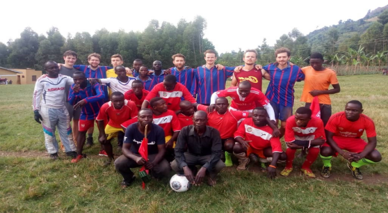
264 Foot Ball team Vs. Mutoto FC