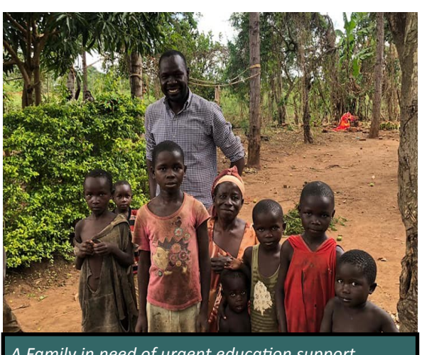
A Family in need of urgent education support

Most families in our community live in absolute poverty and if its your first time to travel in a developing world, particularly Uganda, its strange and hard to believe how most families live on less than a dollar per day. The cultural shock and basic everyday life is a learning and memorable experience. But with the indrawlt poverty ichildren continue to hsve contegious smils to visitors and willing to share a hand shake with greetings "Melembe" a typical sign of love. With our education support program you can be patner in support ing this family with education or a moderate house, cater for medical bills or donate clothes., to do so visit our website and directly DONATE to this needy family. Me and you lets become game changers in someone's life.