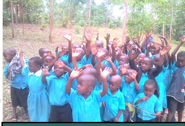
Golden Hill Academy Pupils on assembly 2019

Currently the school has 182 pupils with 9 staff.